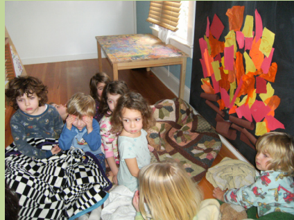
The kids during a story telling session in front of their homemade fire!

The children have been using the materials in the space in new and interesting ways since we came back from the break. Some of you may have noticed googly eyes floating around your house! The children have been decorating their hands with googlies and putting on "monster" puppet shows. Incredible! We love how the children are using materials in our school to create new experiences, and we love watching the children construct knowledge based on their experiences! Constructivist Education! Cool!